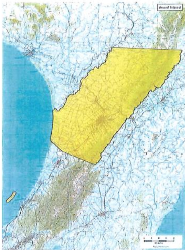
Figure 1 Rangitane o Manawatu statutory area for the purposes of the Resource Management Act 1991.

The Rangitāne o Manawātū Statutory Area of Interest is outlined in Figure 1 below. 1 This cultural and customary connection encompasses 440,000 hectares of the plains divided by the Manawātū River and its tributaries and includes the Manawātū District in its entirety.