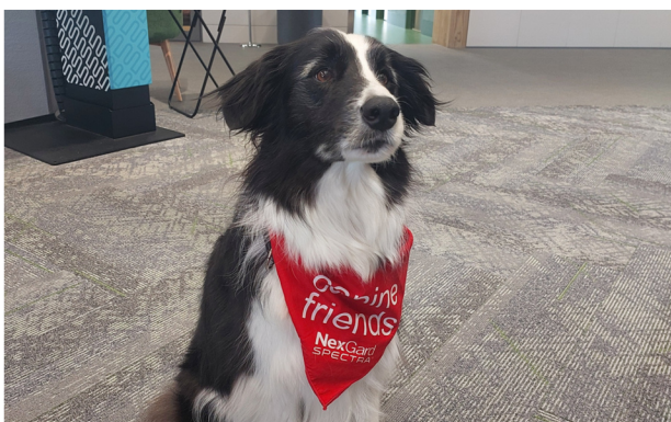
Border Collie Byrne from Canine Pet Friends Therapy Dog also enjoys being read to during the Paws for Reading sessions at Te Āhuru Mōwai.

Reading aloud plays a vital role in developing a child's reading skills. However, many kids become self-conscious as they sound out words or stumble across text. The approach of reading to a dog diminishes the fear of judgment and gradually enhances the child's self-confidence. In a cozy space at Manawatū Community Hub Libraries (MCHL), complete with a large comfortable bean bag, the child reads to the dog, fostering a safe and calming atmosphere. This setup empowers children to read at their level, free from any pressure or criticism.