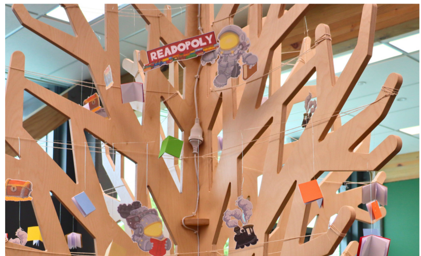
The children's area has a Readopoly hanging display on the wooden tree.