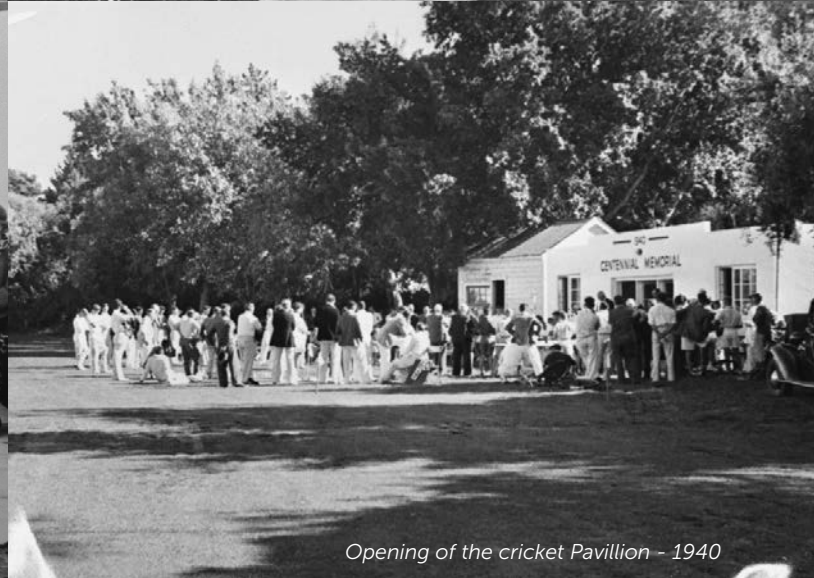
Opening of the cricket Pavillion - 1940