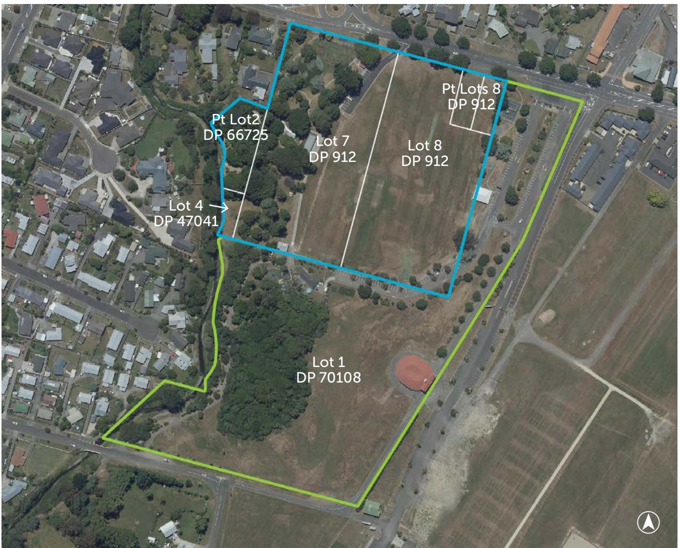
Figure 6– Area of the park proposed to be classified Recreation Reserve