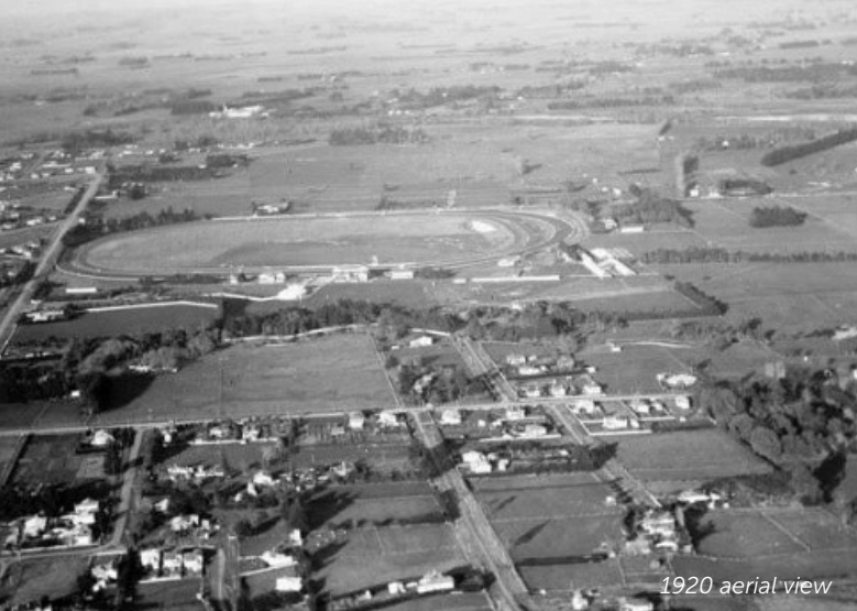
1920 aerial view