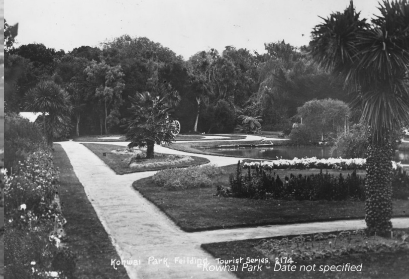
Kohwai Park Feilding Tourist Series 2174 - Kowhai Park - Date not specified