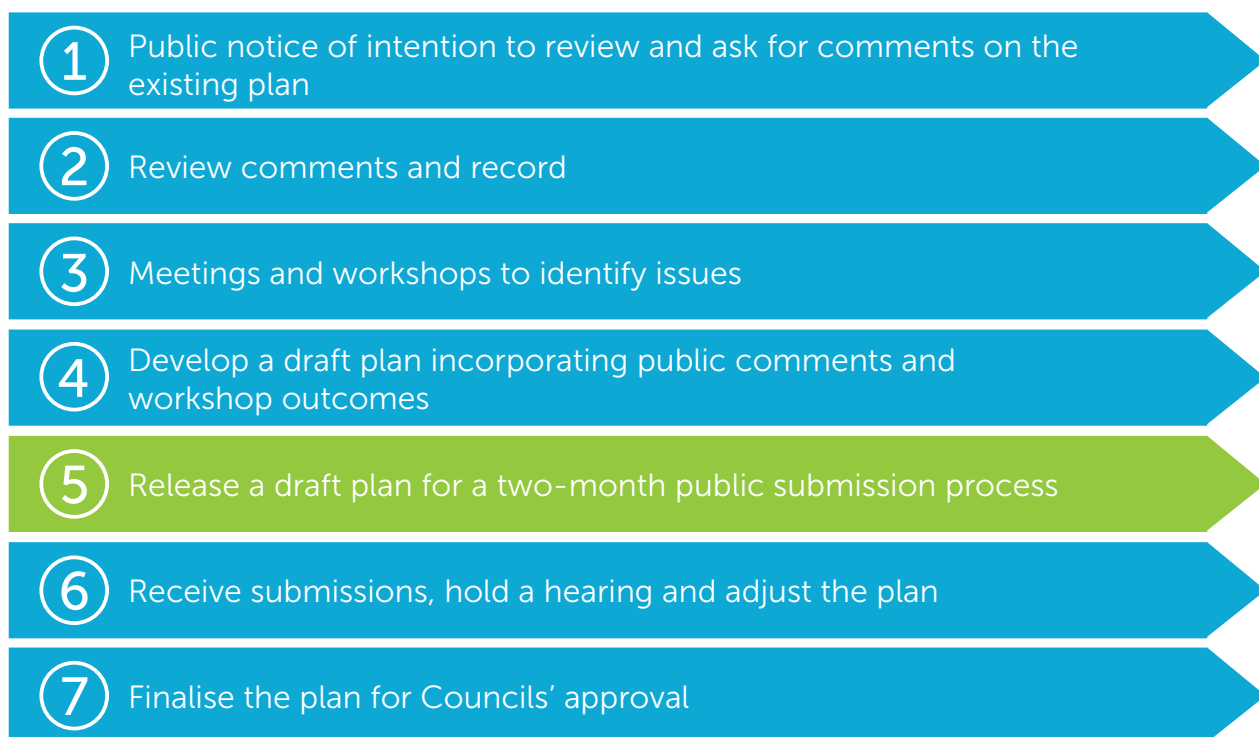
Figure 1: Process to review this draft management plan

Once this draft management plan has been approved by the Council it will be released to the public for a two-month submission process. After the public submission process, hearing and decision making, the final management plan will be put to the Council for adoption.