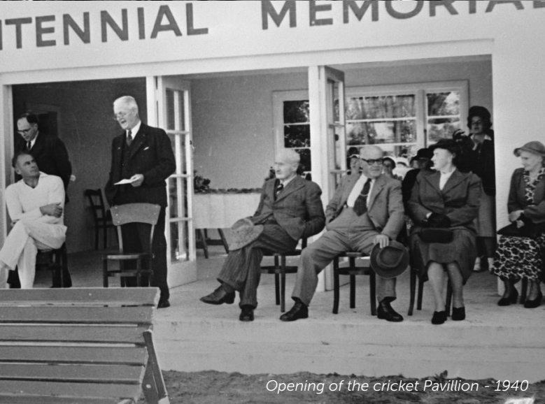
Opening of the cricket Pavillion - 1940