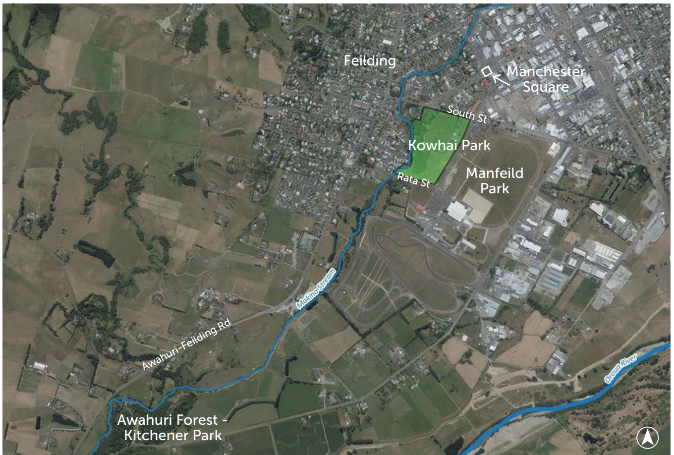
Figure 3 – Location of the park within the immediate setting

Kowhai Park is located less than half a kilometre from Manchester Square in central Feilding (see Figure 3 above). The park is just under 10 hectares and is bounded by South Street, Rata Street and Manfeild Park, a large multi-purpose events complex used for agricultural field days, motor racing and other large events. The Makino Stream runs along the park's western boundary.