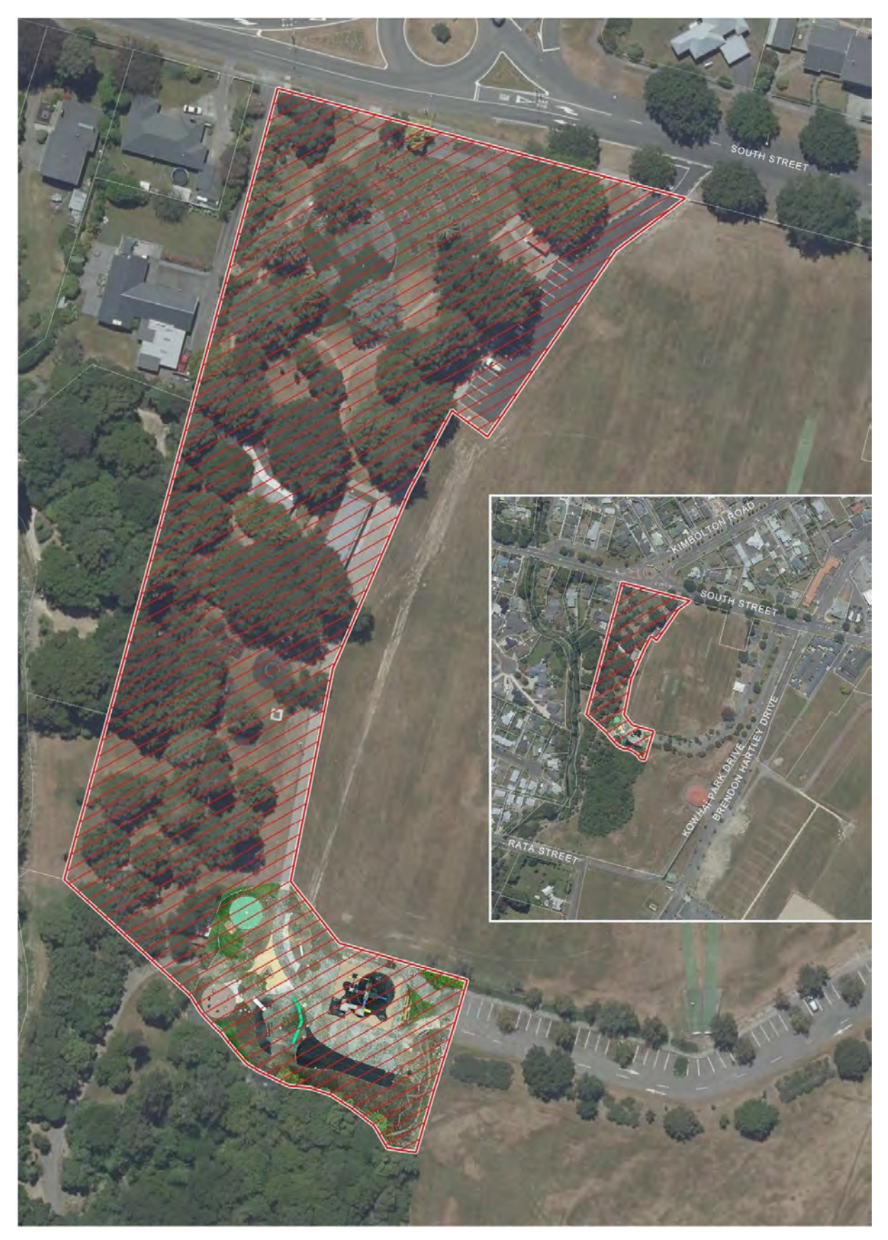
Kōwhai Park Alcohol Control Area