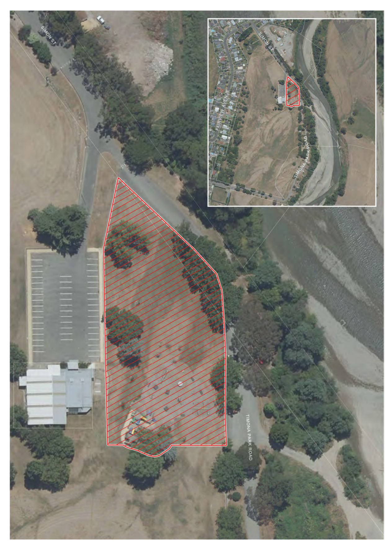
Timona Park Alcohol Control Area