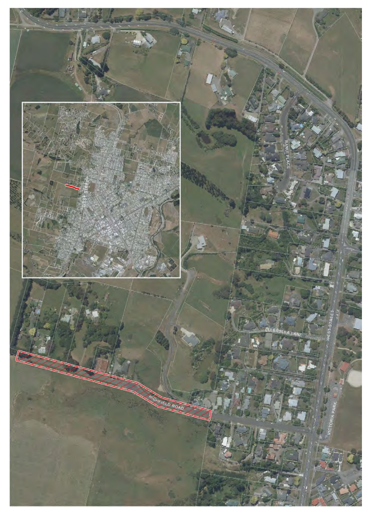
Highfield Hill Lookout Alcohol Control Area