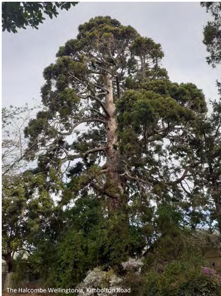
The Halcombe Wellingtonia, Kimbolton Road