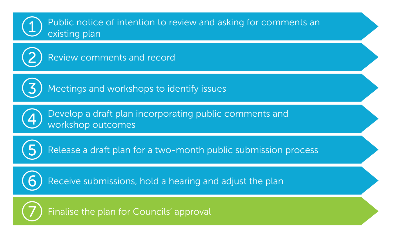
Figure 2: Process and review of the RMGP

Once this draft management plan has been approved by the Council it will be released to the public for a two month submission process. After the public submission process, hearing and decision making, the final management plan will be put to the Council for adoption. Figure 2 illustrates the process to finalise the RMGP.