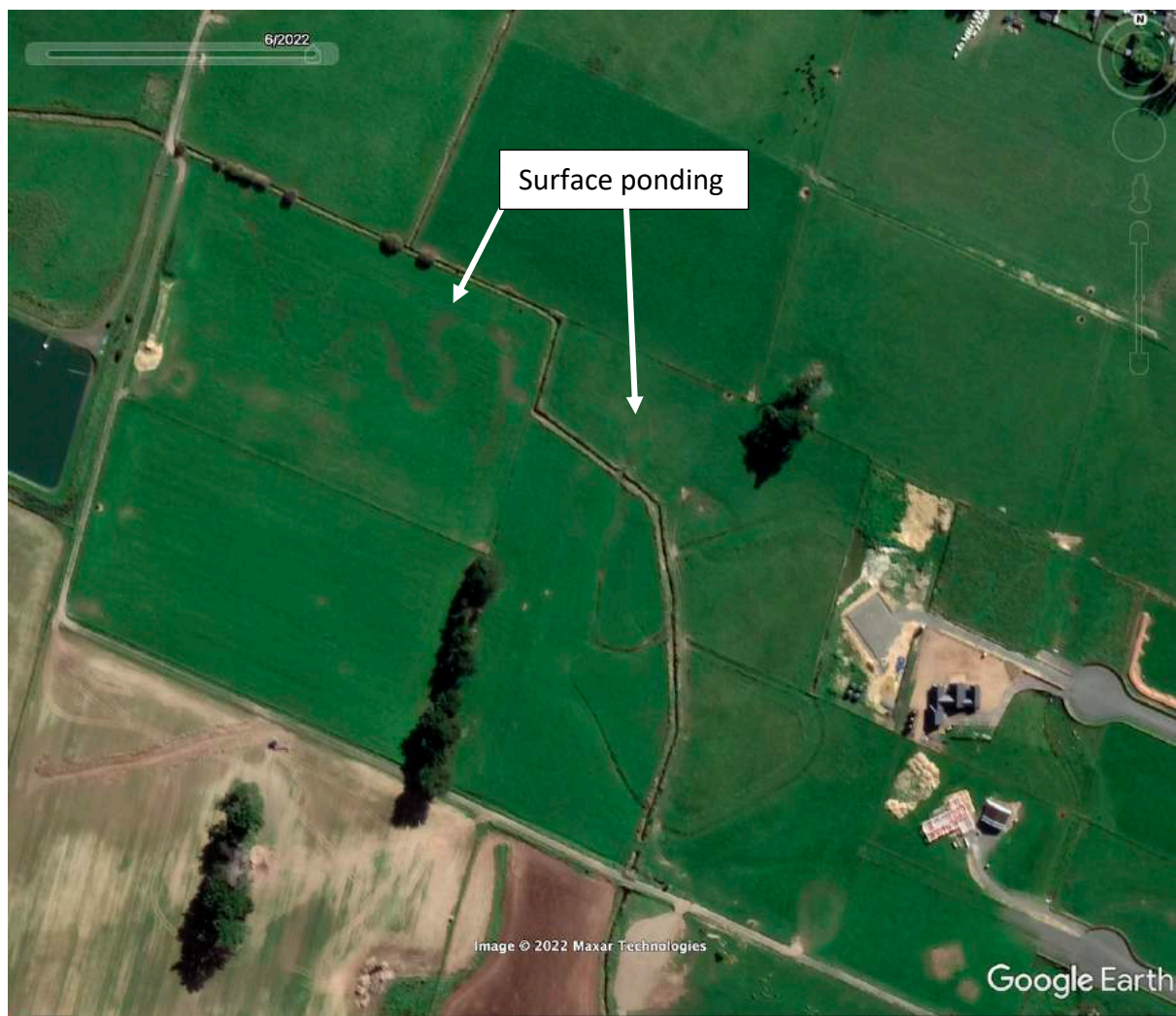
Figure 12. Google Earth Pro imagery showing surface ponding in former waterway alignments on the valley floor.

Site assessment of hydrology indicators showed that extensive areas of the valley floor had surface water ponding (a primary indicator confirming wetland presence). The soil types present indicate prolonged soil saturation (a primary indicator confirming wetland hydrology). Reduced iron is present within 30 cm of the soil surface, inundation is visible on satellite imagery (Fig. 12), the geomorphic position of the valley floor is predisposed to forming wetland conditions and relict flow paths are discernible on the ground surface. Each of these characteristics are secondary indicators of wetland hydrology.