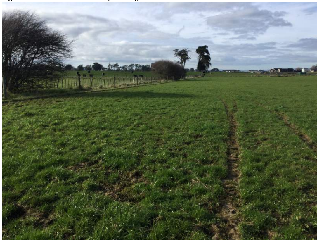
Figure 11. 4WD tracks across waterlogged soils on the valley floor.