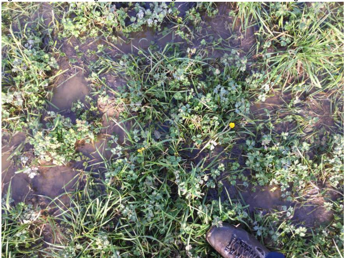
Figure 5. Creeping buttercup and exotic pasture grass growing in a waterlogged site.