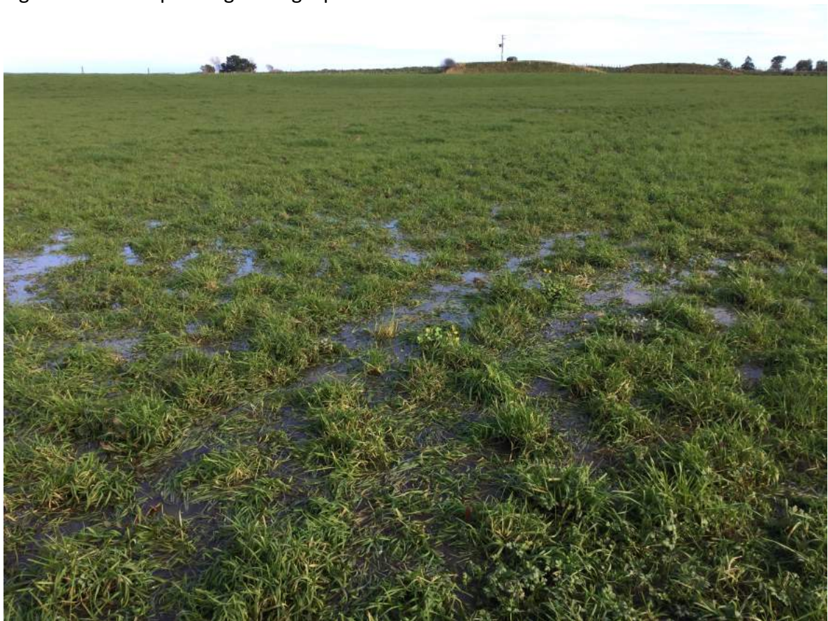
Figure 7. Surface ponding amongst pasture.