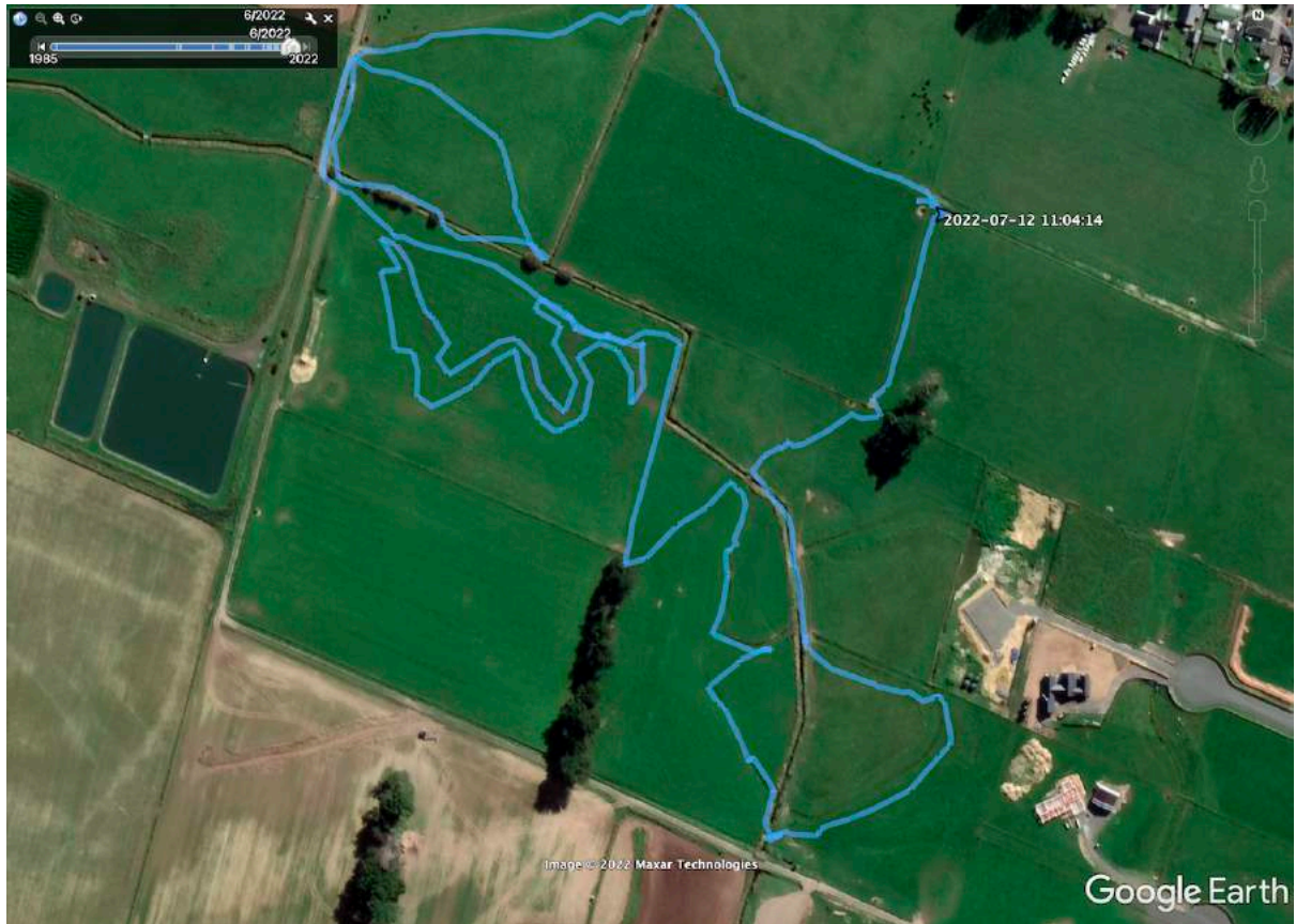
Figure 1. Site visit track log from handheld GPS.

Reference was made to the soil characterisation report prepared by Hainsworth (2022) for the Rongotea Plan Change.