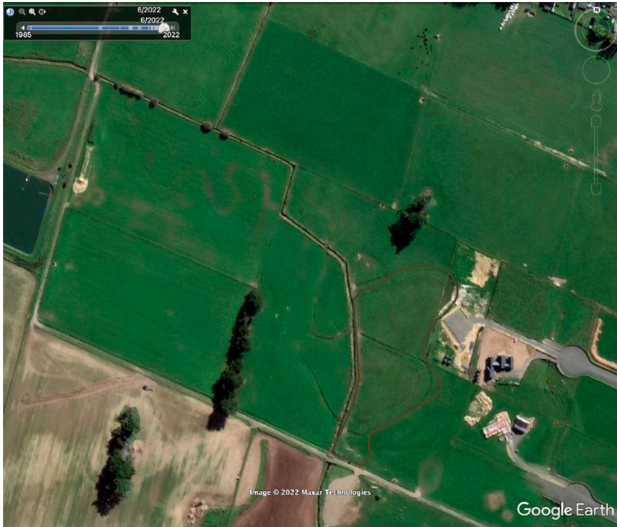
Figure 9. Extent of peaty organic soils transposed from Hainsworth (2022).

Other areas of valley floor are low lying and receive runoff from higher ground. Surface ponding was widespread at the time of the site visit (Fig. 10). The soil surface was in places pugged and featured wheel track depressions from a 4WD previously passing over (Fig. 11). A relict stream channel is present on the true right south of the T-shaped convergence in the existing drain. Artificial drains have been formed elsewhere on the true right of the valley floor. Hainsworth (2022) reports soils in these valley floor areas 2 to be Typic Perch-Gley Pallic (shallow) 3 . Cores appear low chroma and iron residues were noted 25-45 cm below ground level (Hainsworth, 2022).