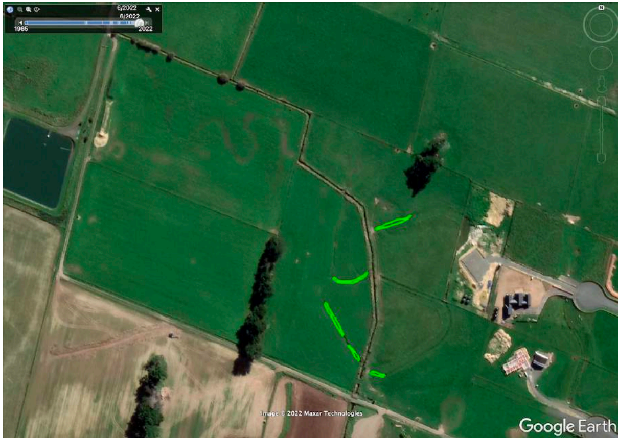
Figure 8. Approximate extent of native wetland vegetation.