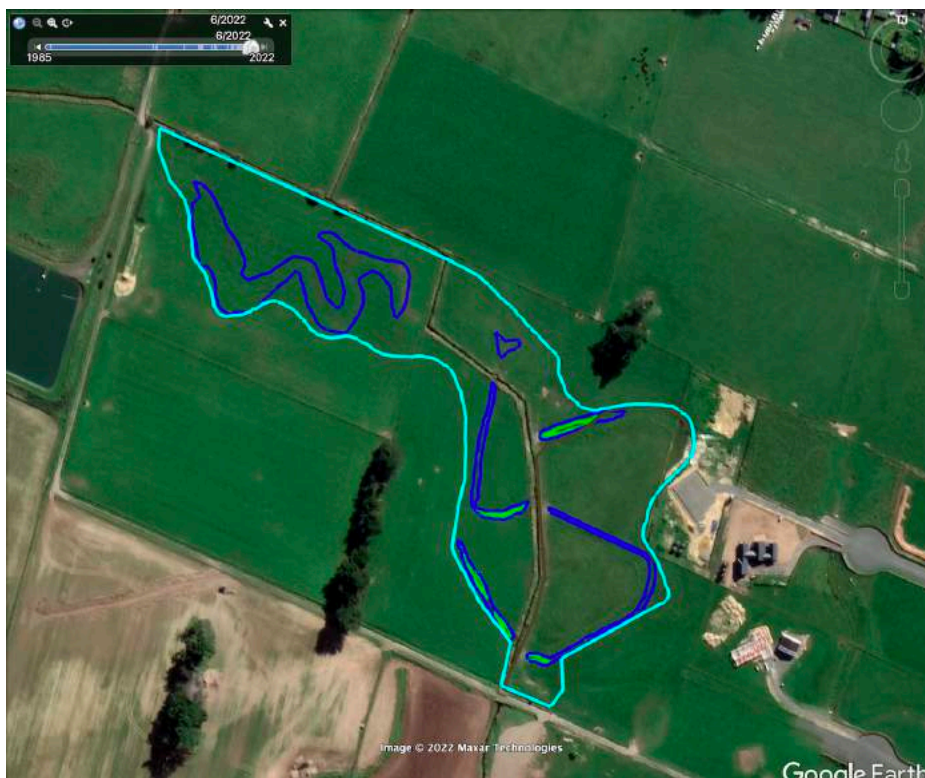
Figure 13. Natural inland wetland extent (light blue line) with areas of noted surface ponding (dark blue line), native wetland vegetation (green fill) and peaty soils (brown line).

Restoration of the natural inland wetland is encouraged. Restoration should involve active interventions and management to restore the natural hydrology and reinstate swamp vegetation across the site.