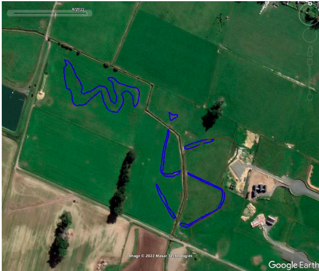
Figure 10. Extent of surface ponding at the time of the site visit.