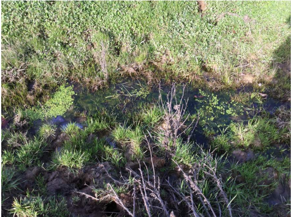
Figure 4. Duckweed and green filamentous algae in one of the artificial drainage channels.