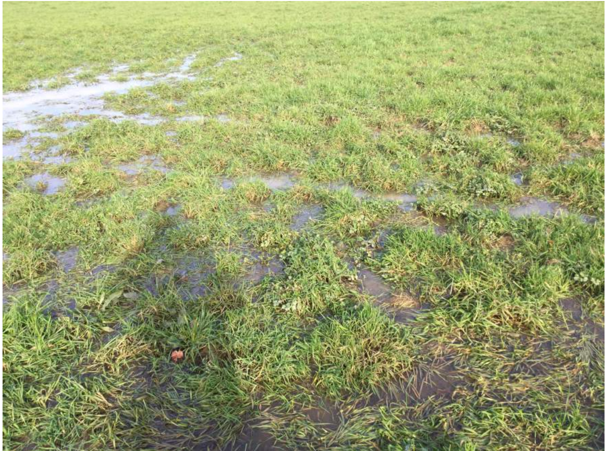
Figure 6. Surface ponding amongst pasture.