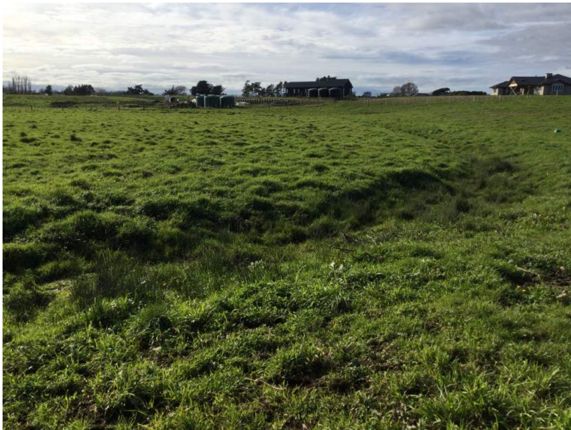
Figure 3. Native rushes colonising artificial drainage channel to the east of the site.

Overall, obligate (OBL) or facultative wetland (FACW) flora are confined to drainage channels and make up only a small area of coverage (Fig. 8).